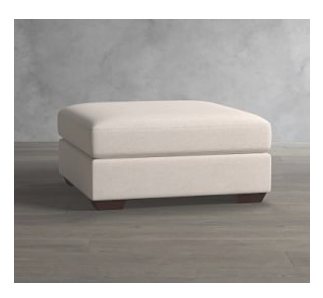
Big Sur Upholstered Sectional Ottoman $699 - $1,049