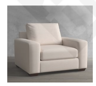
Big Sur Square Arm Upholstered Armchair $1.299 - $1.799