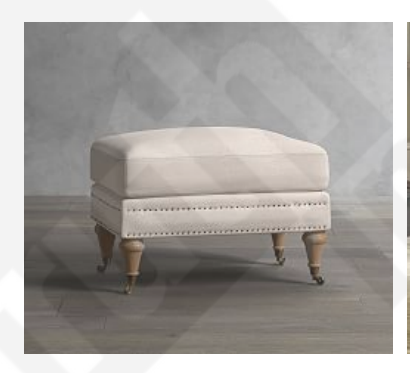
Fionah Upholstered Ottoman An antique French sofa inspired the vintage Built by master upholsterers in the heart of silhouette ...