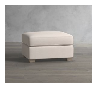
Jenner Upholstered Ottoman $699 - $949