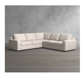
Big Sur Square Arm Upholstered 3-Piece L-Shaped Sectional $4,997 - $6,247