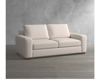
Big Sur Square Arm Upholstered Sofa Collection $1,699 - $3,099