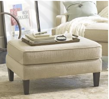
Landon Upholstered Ottoman