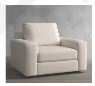
Big Sur Square Arm Upholstered Swivel Armchair $1,399 - $1,899