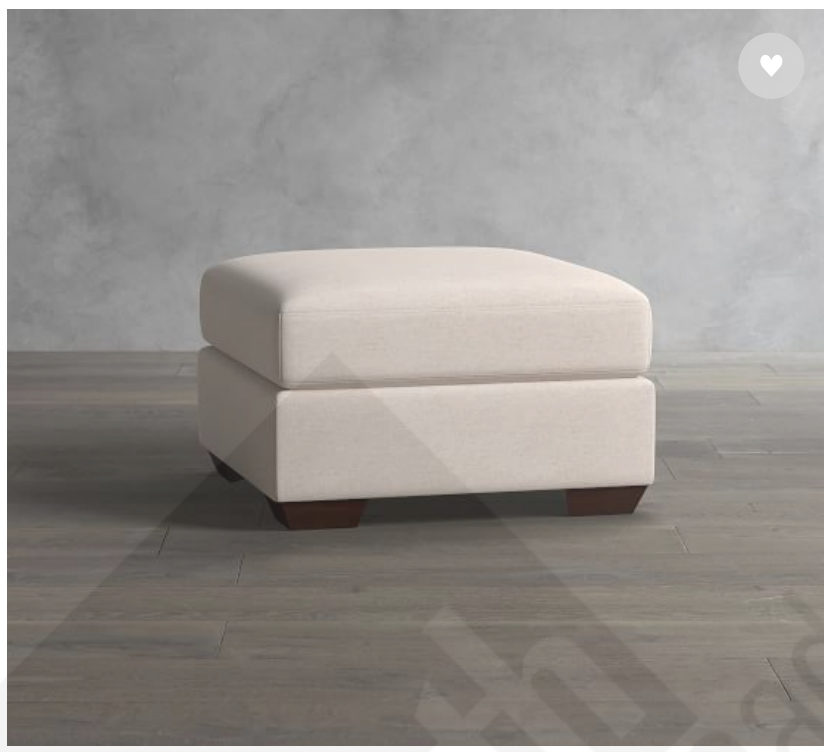
Home > Search Results > Big Sur Upholstered Ottoman