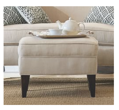
Marcel Upholstered Ottoman