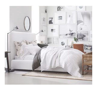
Big Sur Upholstered Bed $1,599 - $2,999