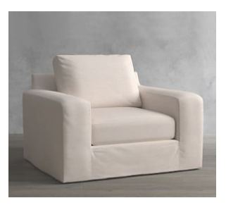
Big Sur Square Arm Slipcovered Armchair $1,399 - $1,899