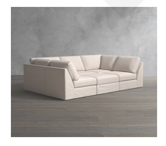
Big Sur Square Arm Slipcovered Pit Sectional $7,494 - $9,744