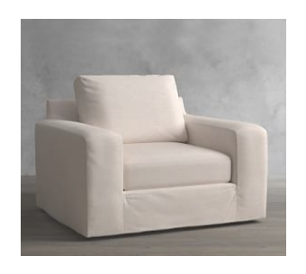
Big Sur Square Arm Slipcovered Swivel Armchair $1,499 – $1,999