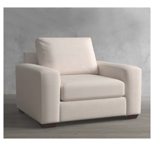
Big Sur Square Arm Upholstered Armchair $1,299 - $1,799