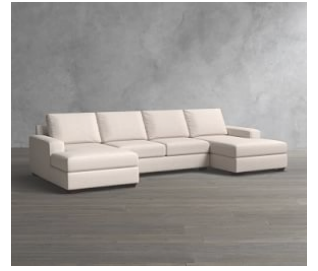
Big Sur Square Arm Upholstered U-Chaise Sectional