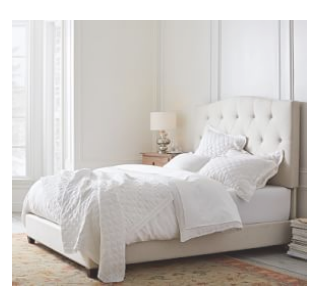
Elliot Upholstered Bed $699 $1,199 Sale $418.99 - $1,199