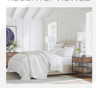
Tamsen Square Storage Bed $2,645 - $4,395