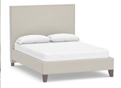
Fillmore Square Upholstered Bed