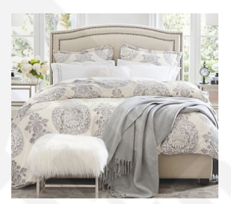
Tamsen Curved Upholstered Bed $1,399 $2,299 Sale $838.99 - $2,299