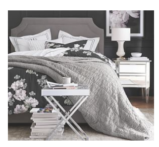
Ardley Storage Bed $2,545 - $4,245