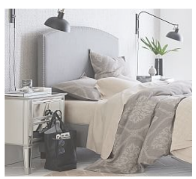
Fillmore Curved Upholstered Tall Bed