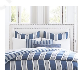
Tamsen Square Upholstered Bed $1,099 – $2,299