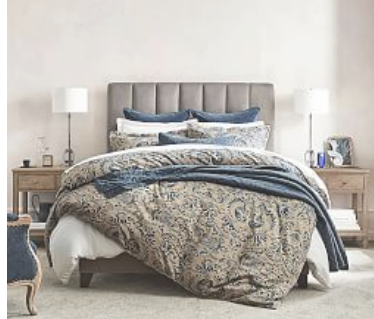
Kira Channel Tufted Upholstered Bed

An updated take on Hollywood glamour, our Kira..