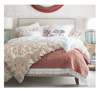
Fillmore Square Upholstered Bed $799 – $1,999