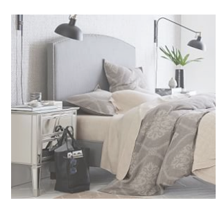
Fillmore Curved Upholstered Tall Bed $799 – $1,999