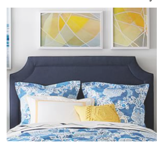
Ardley Upholstered Headboard $649 - $1,299