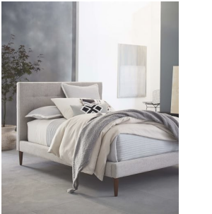
Grid-Tufted Upholstered Tapered Leg Bed $899 $1,499 Special $720 – $1,200