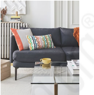
Auburn Sofa (70") $699 Special $560