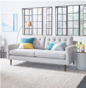
Drake Sofa (76") $999 $1,399 Special $800 – $1,120