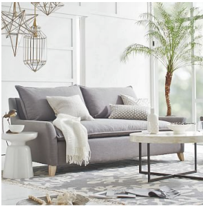
Bliss Sofa (91.5") Whitewashed solid ash legs, a deep, single-seat cushion ... View More