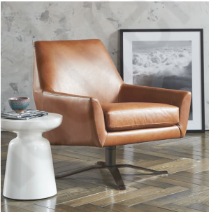
Lucas Leather Swivel Base Chair $1,499 $1,299 Special $960 – $1,040