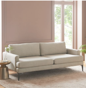
Andes Sofa (86") $4,499 $4,799 Special $1,200 – $1,440