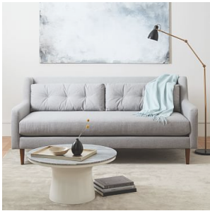
Crosby Mid-Century Sofa (80") Retro details like slim arms, tufted cushions, lofty ... View More