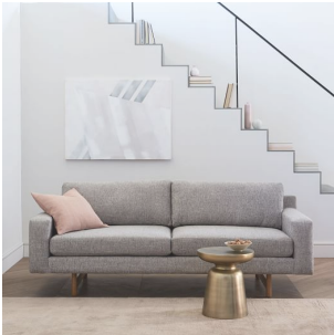
Eddy Sofa (82") $4,299 $4,399 Sale $789.99 – $1,120