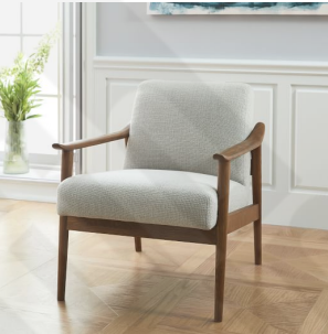
Mid-Century Show Wood Chair $899 $949 Sale $559.99 – $760