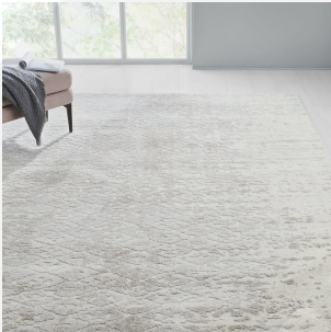
Foil Diamonds Distressed Rug $499 — $1,399 Special $374 — $1,049