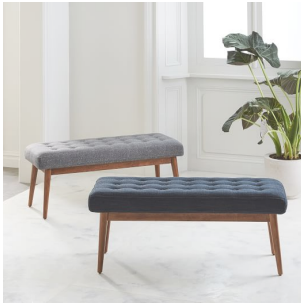
Mid-Century Bench $399 — $649 Special $320 — $520