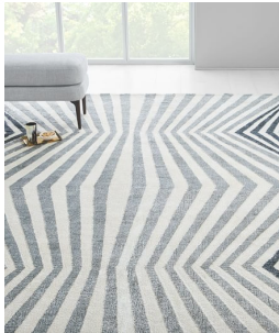
Optic Lines Rug $499 — $1,399 Sale $299.99 — $799.99