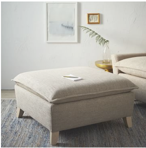
Bliss Down-Filled Ottoman An ideal companion for the Bliss Chair-and-a-Half or ...