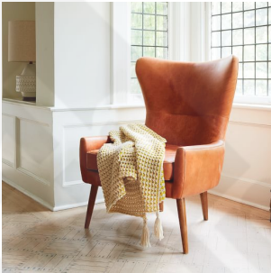
Erik Leather Wing Chair $999 — $1,099 Special $800 — $880