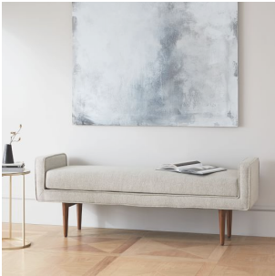
Landry Bench $549 — $599 Sale $359.99 — $480