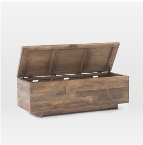
Emmerson® Reclaimed Wood Storage Bench Made from unfinished reclaimed pine certified to Forest ...