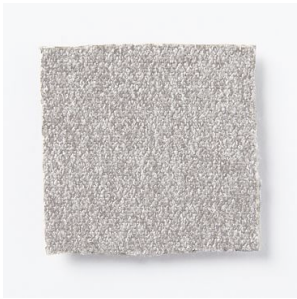
Fabric By The Yard - Marled Microfiber High performance, low maintenance. As hardworking as it ...