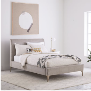
Andes Deco Upholstered Bed $4,499 — $1,799 Special $960 — $1,440