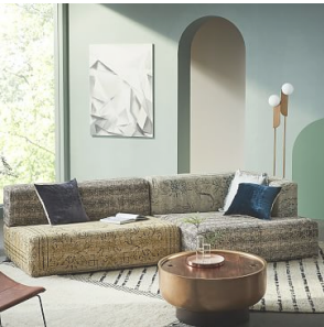
Astrid Bohemian Sectional Our Astrid Bohemian Sectional doesn't shy away from ... View More