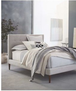
Grid-Tufted Upholstered Tapered Leg Bed $899 — $1,499 Special $720 — $1,200