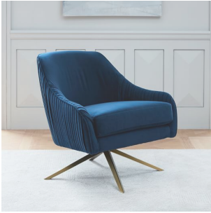
Roar + Rabbit™ Swivel Chair $799 — $999 Special $640 — $800