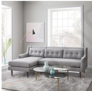
Crosby Mid-Century 2-Piece Chaise Sectional Retro details like slim arms, hand-tufted cushions, lofty ... View More