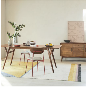
Mid-Century Expandable Dining Table $599 — $799 Special $480 — $640