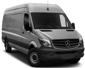
( https://www.mercedesalexandria.cc/2018-mercedes-benz-sprinter-2500-cargo-van-rwd-cargo-van-wd3pe8cd9jp620605 )