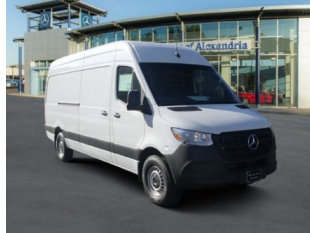
( https://www.mercedesalexandria.cc/2019-mercedes-benz-sprinter-2500-cargo-van-rwd-cargo-van-wd4pf1cd1kp022171 )