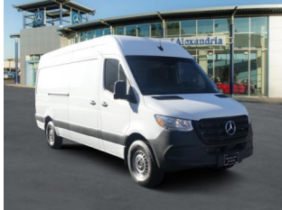
( https://www.mercedesalexandria.cc/2019-mercedes-benz-sprinter-2500-cargo-van-rwd-cargo-van-wd3pf1cd5kp032027 )