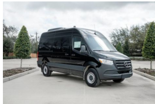
( https://www.mbsugarland.com/inventory/new-2019-mercedes-benz-sprinter-2500-passenger-van-passenger-van-wdzpf0cd1kp054087 )