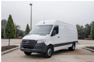
( https://www.mbsugarland.com/inventory/new-2019-mercedes-benz-sprinter-cargo-van-rear-wheel-drive-cargo-van-wd3pf4cc1kp045852 )