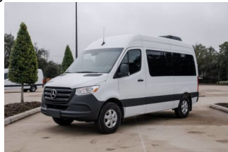
( https://www.mbsugarland.com/inventory/new-2019-mercedes-benz-sprinter-2500-passenger-van-passenger-van-wdzpf0cd1kp036835 )