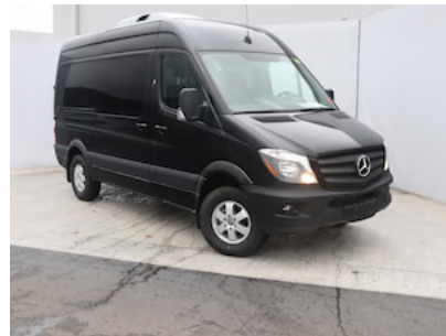
2019 Mercedes-Benz Sprinter 2500 Standard Roof V6 $52,776

(https://pictures.dealer.com/s/sonicbenznashville/1342/5c7c842bf012308e816daecc5346bb8ax.jpg?