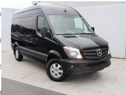
2018 Mercedes-Benz Sprinter 2500 Standard Roof V6 $52,776

(https://pictures.dealer.com/s/sonicbenznashville/1012/42e97a9ff37de8037f5bd0829c345a07x.jpg?