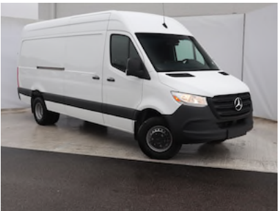
2019 Mercedes-Benz Sprinter 2500 High Roof V6 $50,536