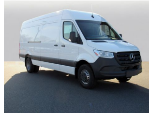
New 2019 Mercedes-Benz

( https://www.mercedes-benz-atlantic-city.com/inventory/new-2019-mercedes-benz-sprinter-4500-cargo-van-rear-wheel-drive-cargo-van-wd3pf4cd9kp028953 )