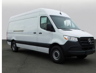
New 2019 Mercedes-Benz

( https://www.mercedes-benz-atlantic-city.com/inventory/new-2019-mercedes-benz-sprinter-crew-van-rwd-full-size-cargo-van-wd4pf1cd6kp023431 )