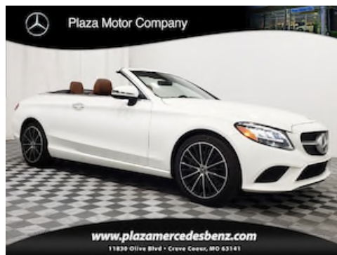
New 2019 Mercedes-Benz C-Class C 300 4MATIC Cabriolet