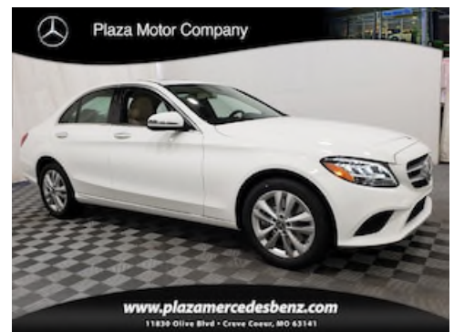
New 2019 Mercedes-Benz C-Class C 300 4MATIC Sedan