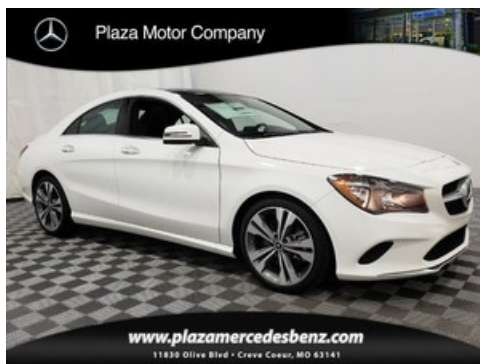
New 2019 Mercedes-Benz CLA 250 4MATIC Coupe