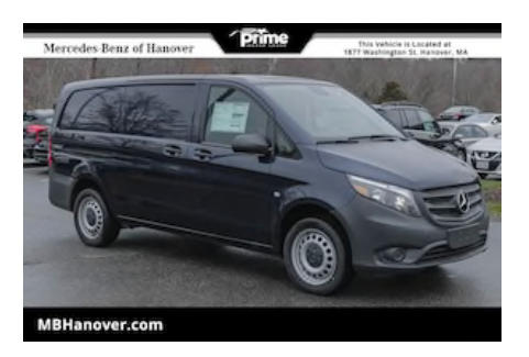
2018 Mercedes-Benz Metris Cargo Van Metris CARGO VAN \$33,\!228