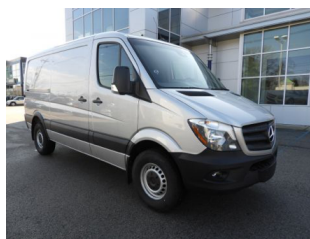
New 2018 Mercedes-Benz

(http://www.tafelmotors.com/invent-2018-mercedes-benz-sprinter-cargo-van-2500-144-wb-rwd-full-size-cargo-van-wd3pe7cd9jp620517)