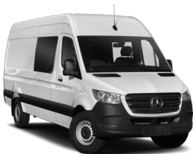
( https://www.mercedesofwichita.com/2019-mercedes-benz-sprinter-sprnt2500-144-crew-rear-wheel-drive-crew-van-wd4pf0cd6kt003357 )