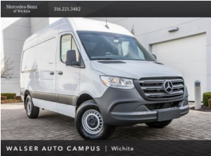
( https://www.mercedesofwichita.com/2019-mercedes-benz-sprinter-sprnt-2500hr-144wb-rear-wheel-drive-cargo-van-wd3pf0cd4kp025516 )