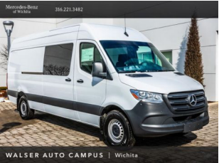
( https://www.mercedesofwichita.com/2019-mercedes-benz-sprinter-sprnt2500hr-170wb-rear-wheel-drive-crew-van-wd4pf1cd0kp058983 )