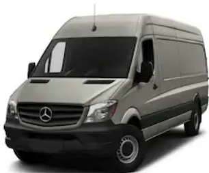
2019 Mercedes-Benz Sprinter 2500 High Roof V6 Van Crew Van MSRP $47,881

Mercedes-Benz of Naperville features many new & pre-owned Mercedes-Benz models for sale in the Naperville area. View popular models such as the Mercedes-Benz C-Class Sedan in Naperville , Mercedes-Benz E-Class Sedan in Naperville , Mercedes-Benz S-Class Sedan in Naperville , Mercedes-Maybach in Naperville , Mercedes-Benz CLA Coupe in Naperville , Mercedes-Benz C-Class Coupe in Naperville , Mercedes-Benz E-Class Coupe in Naperville , Mercedes-Benz CLS Coupe in Naperville , Mercedes-Benz S-Class Coupe in Naperville , Mercedes-AMG GT in Naperville , Mercedes-Benz GLA SUV in Naperville , Mercedes-Benz GLC SUV in Naperville , Mercedes-Benz GLE SUV in Naperville , Mercedes-Benz GLE Coupe in Naperville , Mercedes-Benz GLS SUV in Naperville , Mercedes-Benz G-Class SUV in Naperville , Mercedes-Benz E-Class Wagon in Naperville , Mercedes-Benz C-Class Cabriolet in Naperville , Mercedes-Benz E-Class Cabriolet in Naperville , Mercedes-Benz S-Class Cabriolet in Naperville , Mercedes-Benz SLC Roadster in Naperville , Mercedes-Benz SL Roadster in Naperville , and Mercedes-Benz B-Class in Naperville .