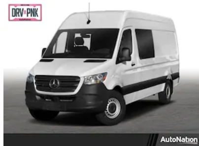
2019 Mercedes-Benz Sprinter 2500 High Roof V6 Van Crew Van MSRP $48,430