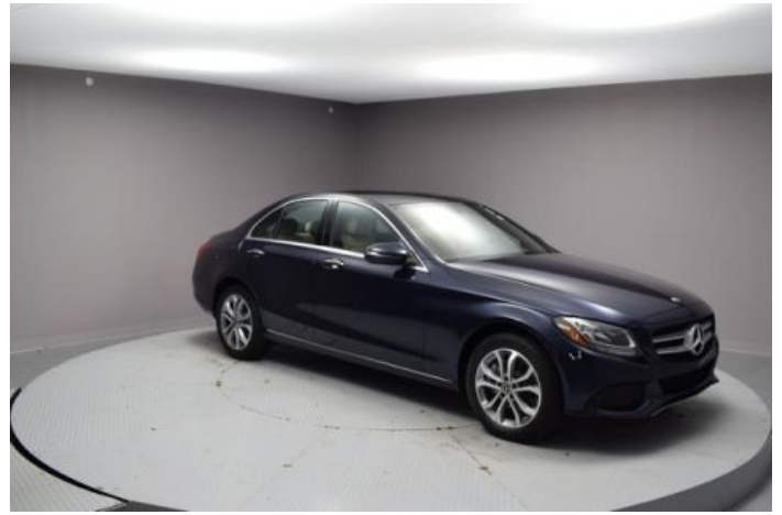
( https://www.mercedesbenzdesmoines.com/inventory/ )