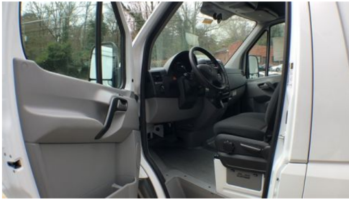
( https://www.buckhead.mercedesdealer.com/inventory/2018-mercedes-benz-sprinter-2500-rwd-3d-cargo-van-wd3pe7cd0ip608045 )