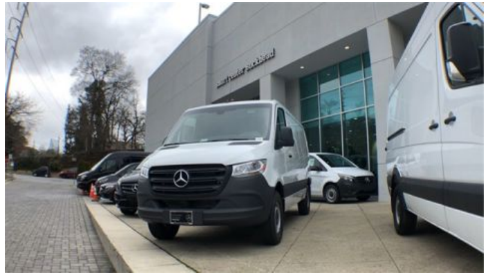
( https://www.buckhead.mercedesdealer.com/inventory/2019-mercedes-benz-sprinter-2500-rwd-3d-cargo-van-wd3pf0cd7kp028345 )