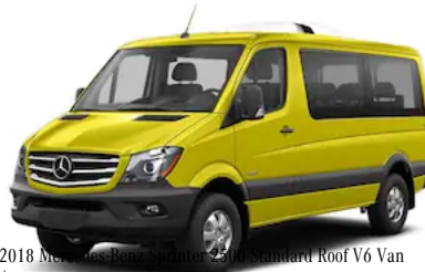
2018 Mercedes-Benz Sprinter 2500 Standard Roof V6 Van $56,099