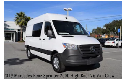
2019 Mercedes-Benz Sprinter 2500 High Roof V6 Van Crew Van $52,333

* While every reasonable effort is made to ensure the accuracy of this information, we are not responsible for any errors or omissions contained on these pages. Please verify any information in question with Critz, Inc.