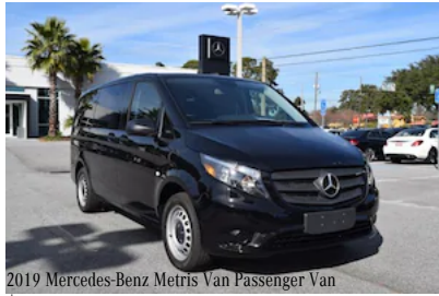
2019 Mercedes-Benz Metris Van Passenger Van $39,738