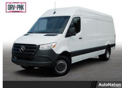
2019 Mercedes-Benz Sprinter 2500 High Roof V6 Van Cargo Van