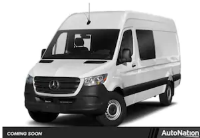
2019 Mercedes-Benz Sprinter 2500 High Roof V6 Van Crew Van MSRP $50,616

Accessories and color may vary. Quoted price subject to change without notice to correct errors or omissions. New vehicle pricing may already include applicable manufacturer special offers which may expire at any time. Manufacturer special offer data and vehicle features is provided by third parties and believed to be accurate as of the time of publication. Please contact the store by email or phone for details and availability of special offers. Sales tax or other taxes, tags, registration fees, government fees, smog certificate of compliance or noncompliance, emission testing charge, electronic filing fee, and $85 dealer document preparation charges is not included in quoted price.