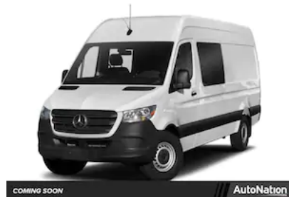
2019 Mercedes-Benz Sprinter 2500 High Roof V6 Van Crew Van MSRP $47,881