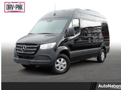
2019 Mercedes-Benz Sprinter 2500 High Roof V6 Van Passenger Van MSRP $60.667

Mercedes-Benz of San Jose features many new & pre-owned Mercedes-Benz models for sale in the San Jose area. View popular models such as the Mercedes-Benz C-Class Sedan in San Jose , Mercedes-Benz E-Class Sedan in San Jose , Mercedes-Benz S-Class Sedan in San Jose , Mercedes-Maybach in San Jose , Mercedes-Benz CLA Coupe in San Jose , Mercedes-Benz C-Class Coupe in San Jose , Mercedes-Benz E-Class Coupe in San Jose , Mercedes-Benz CLS Coupe in San Jose , Mercedes-Benz S-Class Coupe in San Jose , Mercedes-AMG GT in San Jose , Mercedes-Benz GLA SUV in San Jose , Mercedes-Benz GLC SUV in San Jose , Mercedes-Benz GLE SUV in San Jose , Mercedes-Benz GLE Coupe in San Jose , Mercedes-Benz GLS SUV in San Jose , Mercedes-Benz G-Class SUV in San Jose , Mercedes-Benz E-Class Wagon in San Jose , Mercedes-Benz C-Class Cabriolet in San Jose , Mercedes-Benz E-Class Cabriolet in San Jose , Mercedes-Benz S-Class Cabriolet San Jose , Mercedes-Benz SLC Roadster in San Jose , Mercedes-Benz SL Roadster in San Jose , and Mercedes-Benz B-Class in San Jose .