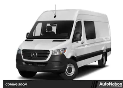
2019 Mercedes-Benz Sprinter 2500 High Roof V6 Van Passenger Van MSRP $65.634