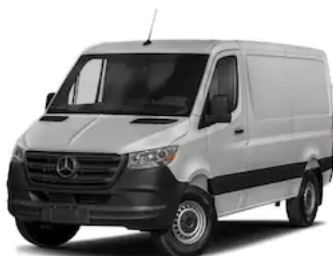
2019 Mercedes-Benz Sprinter 2500 Standard Roof V6 Van Cargo Van MSRP $55,154