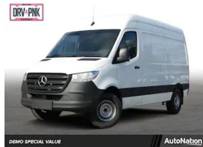
2019 Mercedes-Benz Sprinter 2500 Standard Roof V6 Van Cargo Van MSRP $45,423