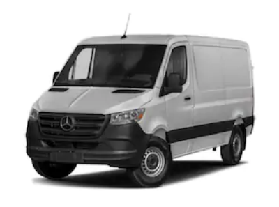
2019 Mercedes-Benz Sprinter 2500 Standard Roof V6 Van Cargo Van MSRP $55,154