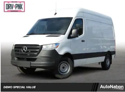
2019 Mercedes-Benz Sprinter 2500 Standard Roof V6 Van Cargo Van MSRP $45,423