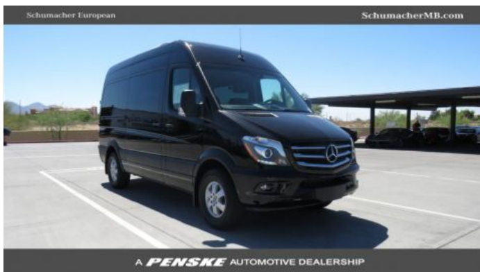
( https://www.schumachermb.com/inventory/new-2018-mercedes-benz-sprinter-2500-passenger-van-rear-wheel-drive-passenger-van-wdzpe7cd5jp609066 )