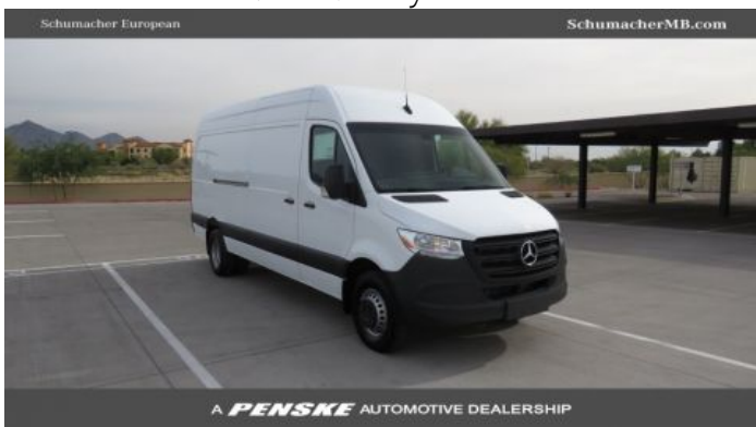
( https://www.schumachermb.com/inventory/new-2019-mercedes-benz-sprinter-cargo-van-rear-wheel-drive-cargo-van-wd3pf4cc9kp038387 )