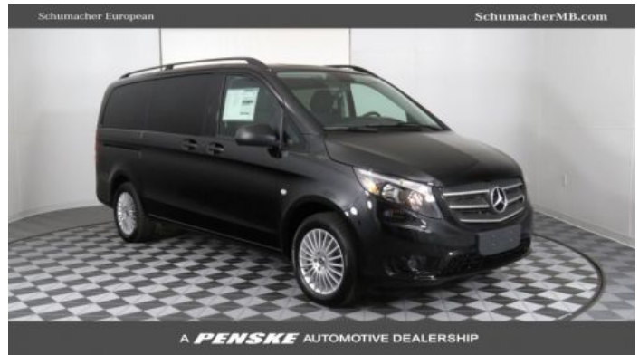
( https://www.schumachermb.com/inventory/new-2018-mercedes-benz-metris-passenger-van-rear-wheel-drive-passenger-van-wd4pg2ee8j3418869 )