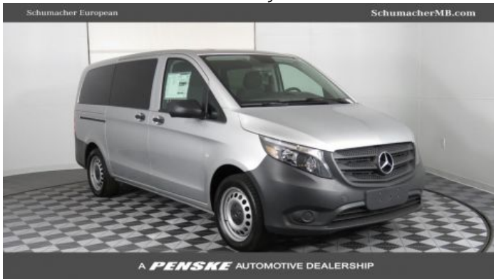
( https://www.schumachermb.com/inventory/new-2018-mercedes-benz-metris-passenger-van-rear-wheel-drive-passenger-van-wd4pg2eexj3399287 )