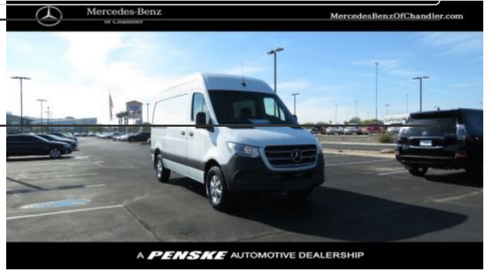
( https://www.mercedesbenzofchandler.com/inventory/new-2019-mercedes-benz-sprinter-2500-cargo-van-rear-wheel-drive-cargo-van-wd4pf0cd5kp039016 )