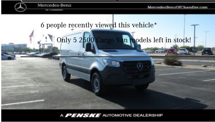
( https://www.mercedesbenzofchandler.com/inventory/new-2019-mercedes-benz-sprinter-2500-cargo-van-rear-wheel-drive-cargo-van-wd3pf0cd3kp024857 )