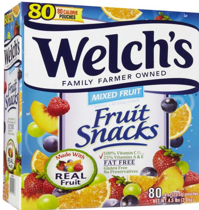
Illustration 2 Welch’s Fruit Snacks, Mixed Fruit

36. For example, the labeling of Defendants’ Berries ’n Cherries Fruit Snacks prominently displays pictures of strawberries, blueberries, raspberries, and cherries, along with a picture of these berries next to the large “Made With REAL Fruit” claim. See Illustration 3 below.