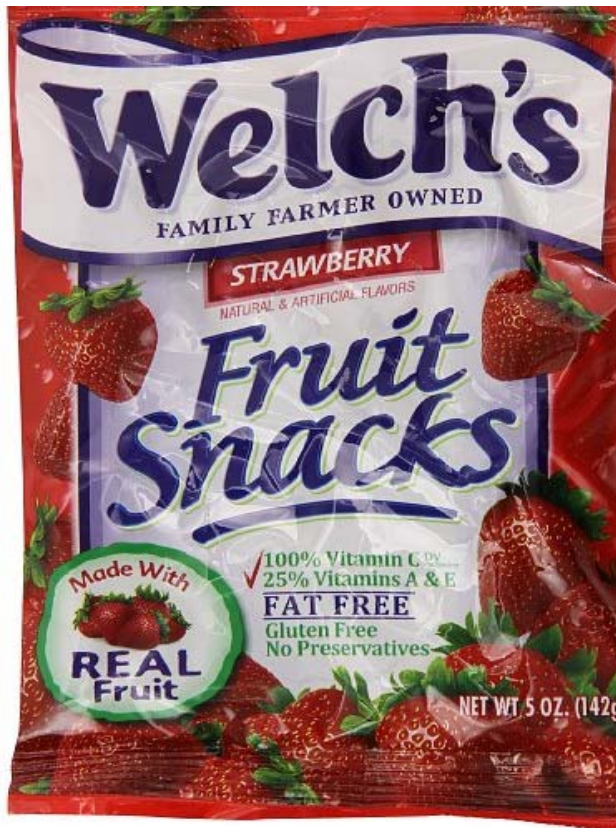
Illustration 4 Welch's Fruit Snacks, Strawberry