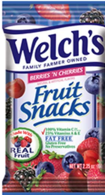
Illustration 3 Welch's Fruit Snacks, Berries 'N Cherries