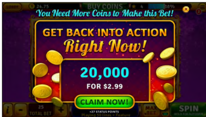
(Figure 2, showing Defendants’ House of Fun game on iOS.)

28. Concurrently with that warning, Playtika provides a link to consumers, allowing them to purchase coins with real money at its electronic store. Playtika’s Slotomania online casino, for example, sells coins from $2 for 7,500 coins to $50 for 320,000 coins. See Figure 3.