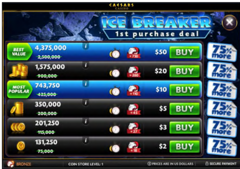
(Figure 4, showing Defendants' Caesars Casino slot game coin prices)

30. The decision to sell coins by the thousands isn't an accident. Rather, Playtika attempts to lower the perceived cost of the coins (costing just a fraction of a penny per coin) while simultaneously maximizing the value of the award (awarding millions of coins in jackpots), further inducing consumers to bet on its games.