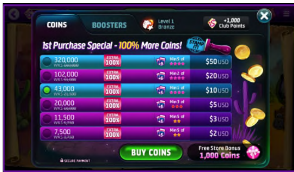
(Figure 3, showing Defendants’ Slotomania coin prices)

28. Concurrently with that warning, Playtika provides a link to consumers, allowing them to purchase coins with real money at its electronic store. Playtika’s Slotomania online casino, for example, sells coins from $2 for 7,500 coins to $50 for 320,000 coins. See Figure 3.