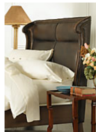
All of our leather beds are handcrafted using the finest top grain leather.