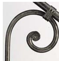
Hand-forged iron scrollwork and joinery.