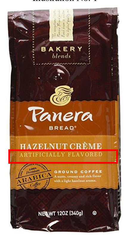
Illustration No. 1