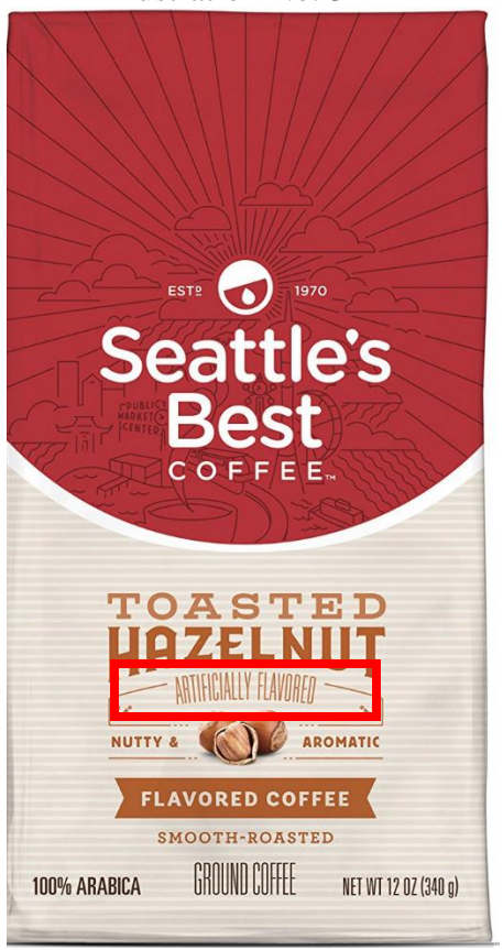
Illustration No. 3