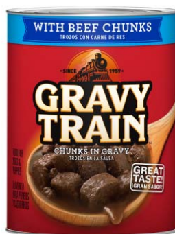
21 Gravy Train® Chunks In Gravy With Beef Chunks wet dog food is 22 bursting with the hearty flavor of real beef. And all the meaty 23 goodness is covered in a rich savory gravy to make a hearty meal 24 your dog will love.

12 37. Instead, the advertising and labels intentionally omit any reference to the 13 food being adulterated: