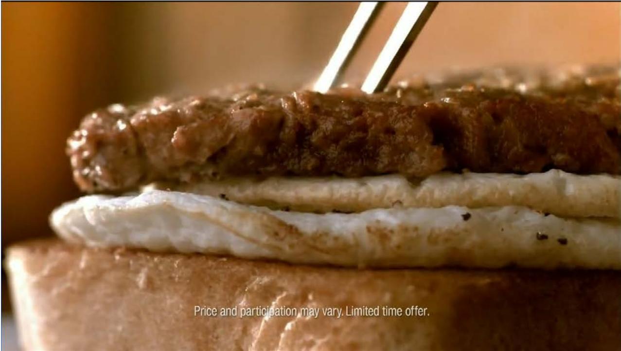
"Fellow-Steak-Lover Handshake" Commercial at 00:16. J. App'x at 110 n.1.