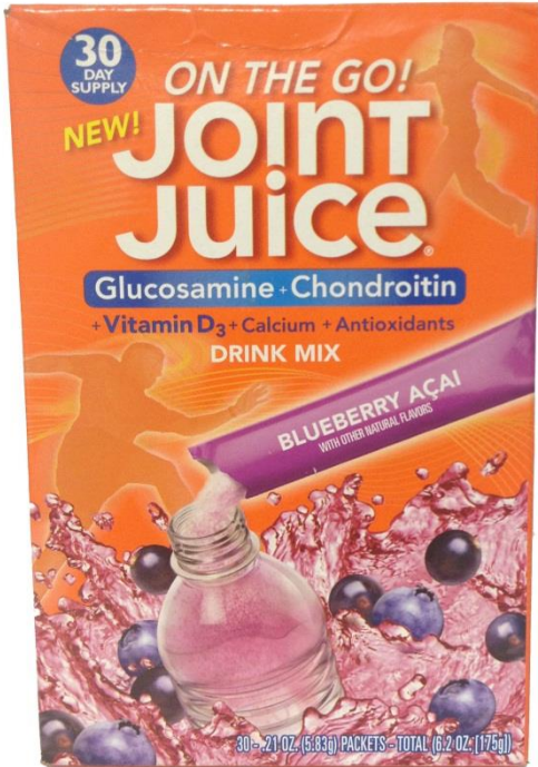
Drink Mix Box (Front)