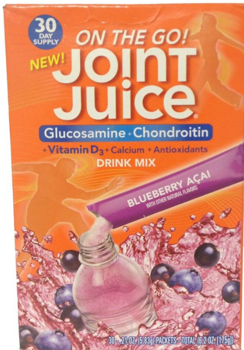
Drink Mix Box (Front)