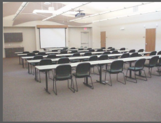
Seminar Room Rental Singapore