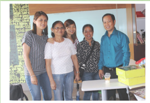
With my sister and niece getting over from their diseases of cysts, goiter, vertigo, etc.

*NUTRIA is a powerful antioxidant food supplement with key vitamins, minerals, and phytonutrients from 20 fruits and vegetables to support our immune system. These fruit and vegetable-based antioxidants including SelenoExcell selenium found in Nutria protect cells and have been shown to fight diseases, including cancer. Its strict manufacturing process assures us of consistent quality and potency.