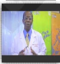
HRT by Dr. ...