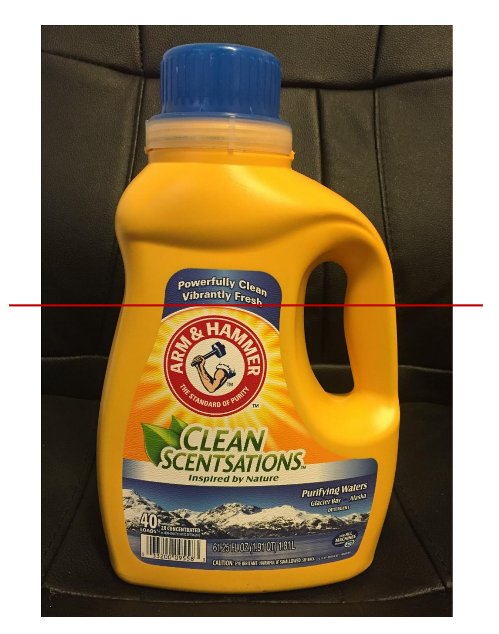
The Arm & Hammer<sup>TM</sup> Liquid Laundry Detergent 61.25 Fl. Oz. Product is packaged in a bottle that is approximately 7 x 3.6 x 11.1 inches with a bottle cap that is about 1.75 inches in height. The total volume capacity of the Product is approximately 74.00 fluid ounces, leaving a difference of 13.75 fluid ounces or approximately 18% non-functional slack-fill.