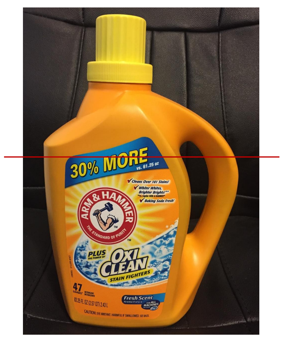
Arm & Hammer<sup>™</sup> Liquid Laundry Detergent– 82.25 Fl. Oz. Product