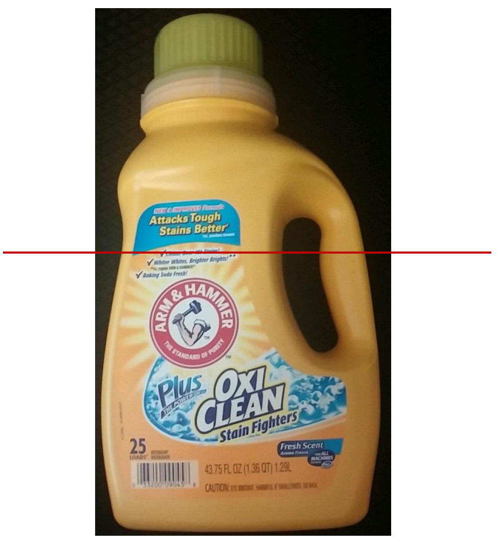
Arm & Hammer<sup>™</sup> Liquid Laundry Detergent– 43.75 Fl. Oz. Product