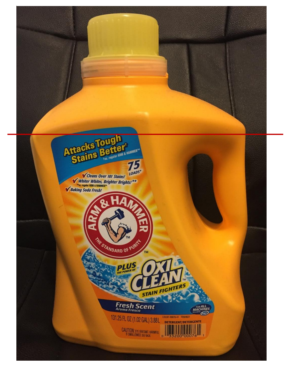
Arm & Hammer<sup>™</sup> Liquid Laundry Detergent– 131.25 Fl. Oz. Product