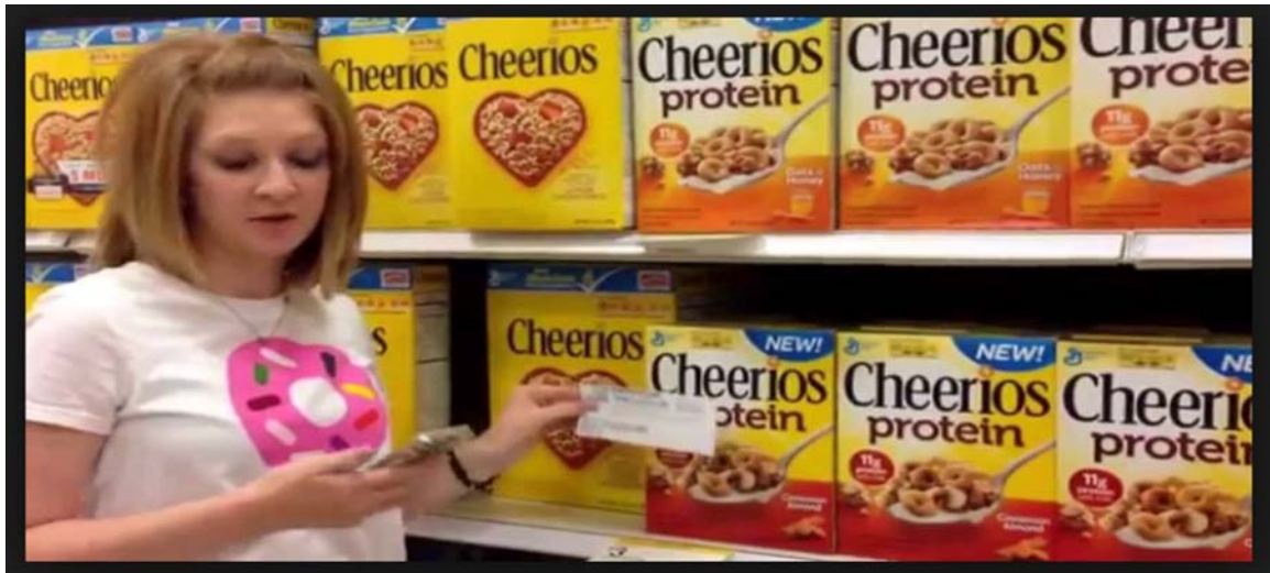
7 Illustration 1 8 Cheerios Protein and Cheerios Display

17 31. But, two hundred calories of Cheerios delivers 6 grams of protein whereas 200 18 calories of Cheerios Protein (Oats & Honey) delivers only 6.7 grams, and 200 calories of 19 Cheerios Protein (Cinnamon Almond) only 6.4 grams. See Illustration 2.