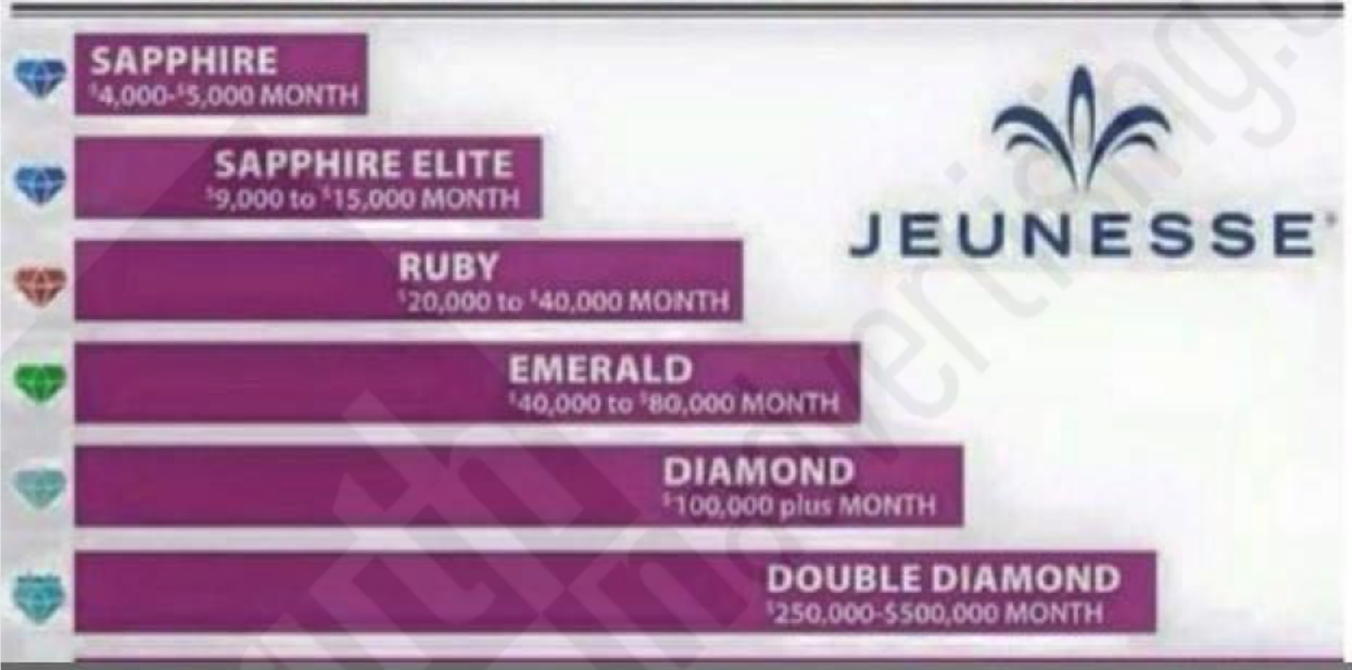
Jeunesse Global Earnings per rank