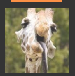
War Giraffe US E-Liquid