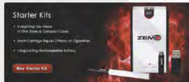
E-Cigarette Rechargeable Kits