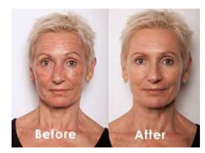
"I love my new skin and I love what I see in the mirror. I've tried dozens of products and treatments but none worked better than Lavish Skin Care and Derma Bright. Thank you from the bottom of my heart!"