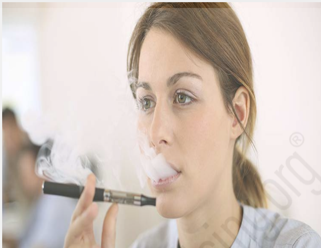
Science behind vaping

Nothing Actually Burns – E-cigarettes run on lithium batteries. Because of this there is nothing to light, and no smoke. It is made of a vaporization chamber and cartridge that is filled with a liquid. When you puff on the e-cigarette the battery powers the device to heat the liquid and vaporizes it. Some e-cigarettes have a tip that glows and some do not. It all depends on your personal preference. Because they do not burn tobacco there is no carbon monoxide and no odor.