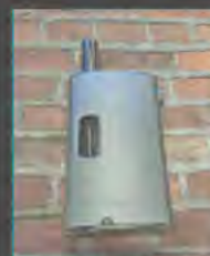
Joye eGrip VV Kit $69.95