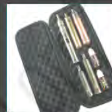
Aria EVA Case $24.95