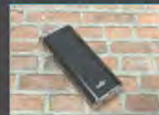
30W e-Leaf iStick Full Kit $44.95