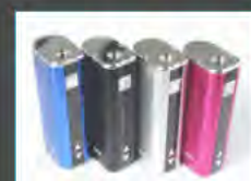
20W e-Leaf iStick Full Kit $39.95