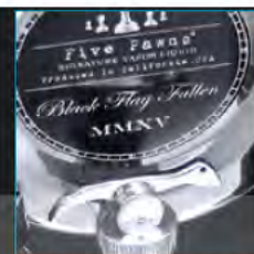
Five Pawns Black Flag Fallen $30.00

The E-cartridge is mainly composed of propylene glycol, and a very small amount of nicotine. Propylene Glycol is a food additive found in many foods we eat today, such as food coloring, flavoring and also used to keep food, medicines and cosmetics moist. It is considered as generally safe and it is the element that helps to create the vapor that simulates smoke. Nicotine is an alkaloid that is naturally present in certain plants. A high presence is found in tobacco and a low presence is found in common vegetables such as potatoes, tomatoes and green peppers. Nicotine, when delivered in small dosages such can deliver a feeling of calmness or relaxation. Current available information states that nicotine in and of it self has not been shown to promote the development of cancer in healthy tissue. Additionally, it has not been shown to have any mutagenic properties. This being said, it should also be noted that the International Agency for Research on Cancer has not evaluated nicotine as of this time.