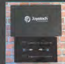
Model Joye 510 Electronic Cigarette Manual Starter Kit Reg. Price: $49.95 Sale Price: $32.95