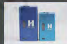
Hana Modz DNA 30 Mini Reg. Price: $249.95 Sale Price: $129.95