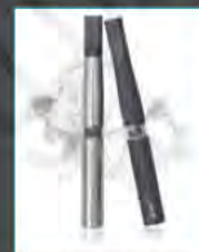
Joye eGo Kit Reg. Price: $59.95 Sale Price: $49.95