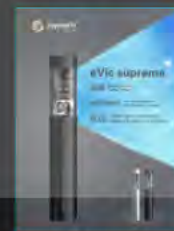
Joye e-Vic Supreme Reg. Price: $159.00 Sale Price: $99.00