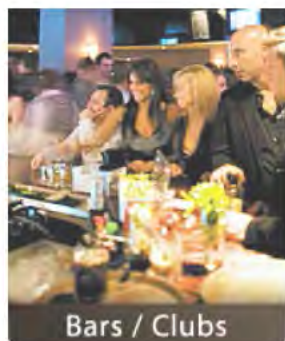
Bars / Clubs