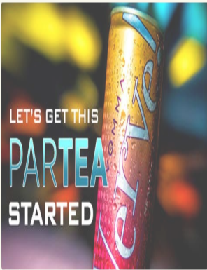
Let's Get This Partea Started!