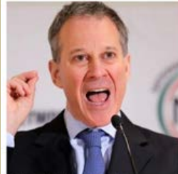
Double standard: Attorney General Eric Schneiderman continues a weak case against righty Hank Greenberg, but ignores lefty Jon Corzine.

The absurdity of the argument only lends credibility to the claim being advanced by some people on Wall Street, and increasingly in Washington, that Schneiderman should be investigated, for leading possibly the most politicized law-enforcement outfit in the country.